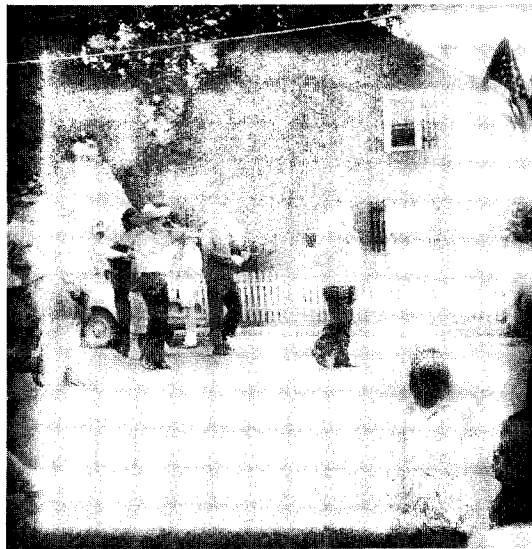
The incomparable Barcroft Marching Band and its veteran color guard, under the direction of Jack Turner (trumpet and sombrero, center).

FOR SALE Solid wood wall unit with fold-down desk, $150. Compact refrigerator, perfect for dorm room, $40. Call Jim or Kathy, 892-6458.