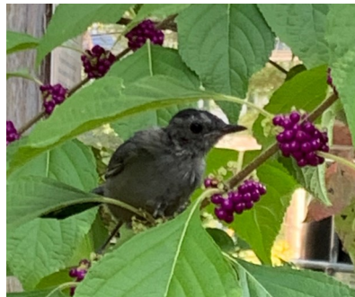
Juvenile Grey Catbird eating berries of American Beautyberry shrub.

Spring planting for many people consists primarily of filling pots with colorful flowers. The absence of annuals might seem like a problem until you learn that native plants make excellent container specimens as well, with the added advantage that they only need