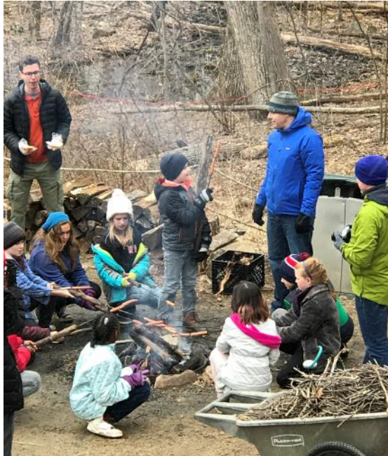
Fifth graders cook lunch at the outdoor lab (above) and student artwork promoting STEAM night (below).

Thanks to all the neighbors who ordered a pizza from Brick's during our recent Barcroft PTA fundraiser. We really appreciate your support! •