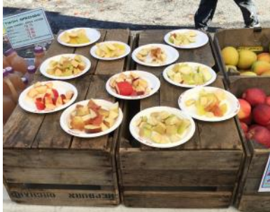
Apple samples at the market.

That concept fell on fertile ground when it was presented to members of the Arlington Forest and Buckingham Community civic associations. A local market committee was soon established with a plan to open the sum-