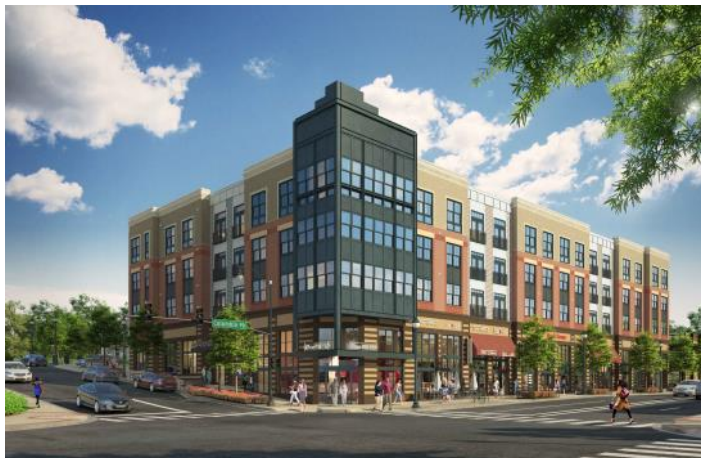
Artist's rendering of Trafalgar Flats seen from the corner of Buchanan and Columbia Pike.

Trafalgar Flats, 78 brand new condominiums, is now under construction at the corner of Columbia Pike and South Buchanan Street. The community represents one of the first opportunities in years to own a brand new condominium along the Pike.