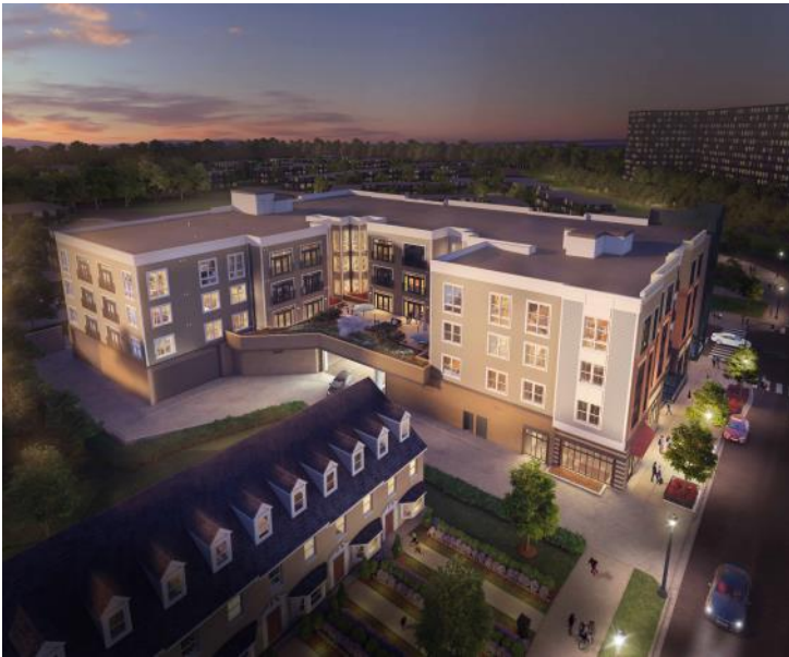
Artist's rendering of the building currently under construction looking south from Buchanan.

steel appliances and expansive windows al-