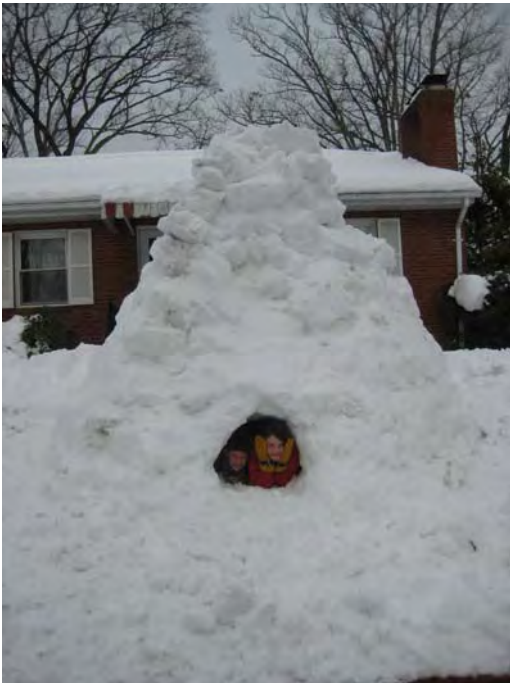
Amazing Igloo on 6th St. South An adult could stand inside it!